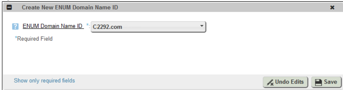
Figure 2: Create New ENUM Domain Name ID

Select an ENUM domain name value and then click Save .